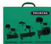
7F-CNW90 and 9F-CNW100EPAL in a metal case

The coilnailers are versatile applicable.