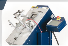
Easy Tilt Adjustment