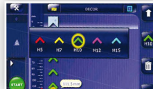
Touch Screen P.C. Memory Programming