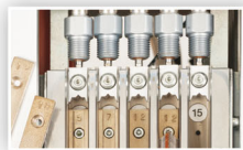
Changeable V-Channel Inserts